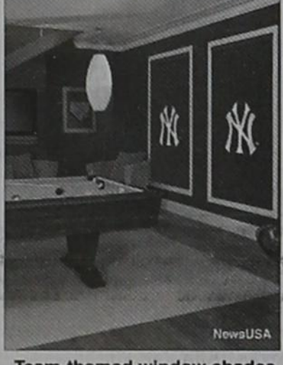
Team-themed window shades are a great addition to any sports media room.

versity of Connecticut. In addition to showing your team spirit, the roller shades are designed to block excess glare. Pull down the shades and enjoy every play of the big game without excess light reflecting on your TV. Even when the TV is off, the team-themed window shades cre-