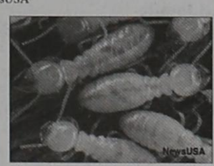
If you suspect a termite infes-tation, contact a pest profes-sional immediately.

However, if termites have already made their way into your home, it is important to contact a licensed pest professional to assess the situation. There are many solutions to control termite infestations, including barrier treatments and baiting systems and your professional will help you to select the most effective trea plan to suit your needs.