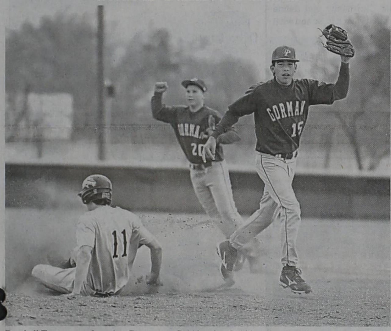
Baseball Tournament featuring Gorman vs. Goldthwaite. Goldthwaite runner is out at second base.

Daylight Savings Time -- Spring Forward On March 13th