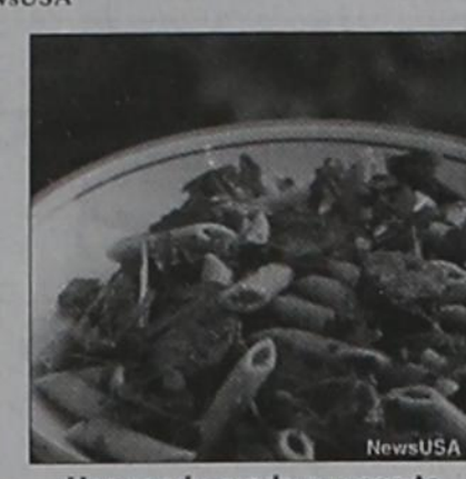
Use ready-made sauces to assemble a delicious, healthy meal in minutes.

4) Perk up any meal with fresh herbs. Add fresh basil to a simple pasta dish, cilantro to plain rice, or rosemary to roasting potatoes.