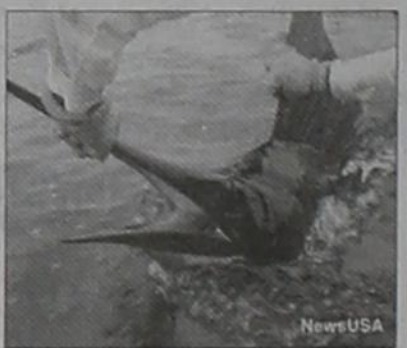
Try deep sea fishing on your next vacation.

· Look for an experienced deep sea fishing charter. A qualified deep sea fishing boat will take you to the best fishing spots and provide the correct bait for the fish that you want to catch. Fishing licenses are required and cost $25 per year. All good boats practice catch and release on all bill fish to ensure good fishing to the future generations. There are restaurants that will cook your