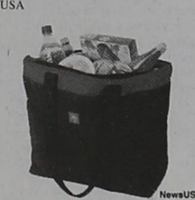
Durable, reusable, insulated grocery totes are a greener way to carry your groceries.

California Innovations has leveraged their knowledge of insulated technology to develop a quality line of durable, reusable grocery totes. Their 45 Can Freezer Tote features high-density thermal insulation plus Therma-Flect Radiant Barrier, so groceries stay cold for hours. The interior is easy to wipe clean and has Microban, which helps protect the lining from bacteria that cause odors and stains. All of these grocery totes carry the Ultra Safe designation, which