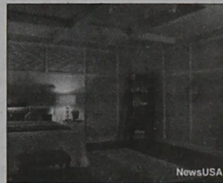
Specialized window shades can block out the light as well as save on energy bills.

(NU) - Do you have trouble falling asleep or staying asleep through the night? The importance of a good night's sleep is well known. According to the National Sleep Foundation, adequate sleep has been associated with a better mood, better health and better job performance. It's important to address factors that might interfere with a good night's sleep. Light is one of these factors. The body responds to light as a cue to stay awake, so sleeping in a dark, quiet room can help you fall asleep, stay asleep and wake up refreshed.