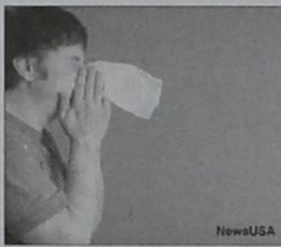
Boosting your immune system is key to being prepared against virus mutations this flu season.