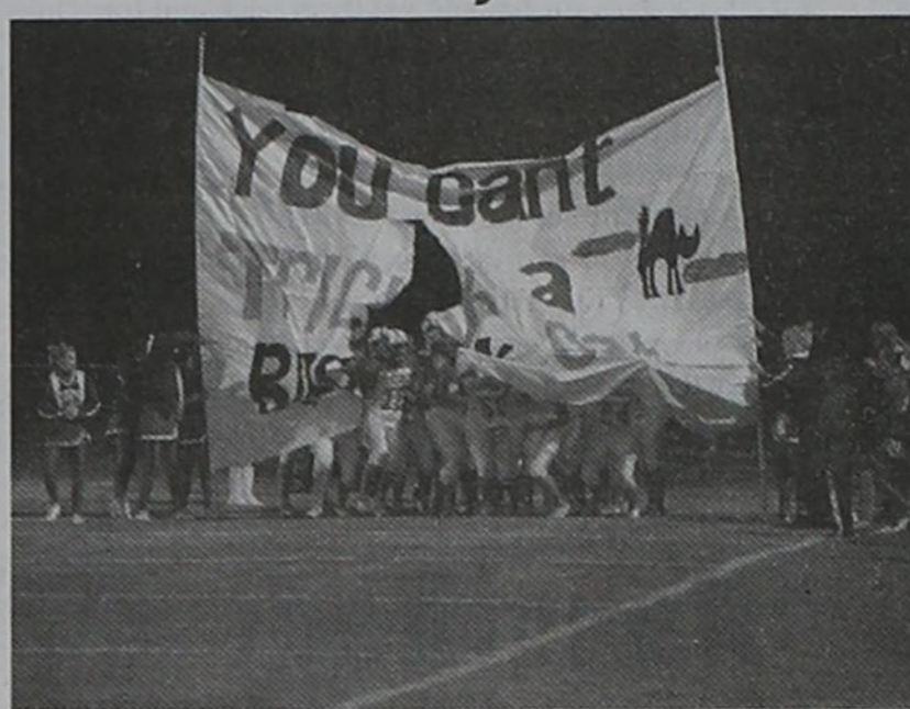
STARTING RUN THRU -- The Panthers entering the field at the start of game action in Santo.

Eastland County Property Tax Office and Registration Office hours are Monday thru Friday, 8 a.m. To 4:30 p.m. Closed for lunch from 11:30 to 12:30 To accommodate most lunch hours. Thanks