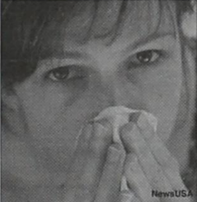
Early treatment at the onset of symptoms could reduce the duration and severity of your cold.

"Hygiene also plays a role, so take care to wash hands fre-