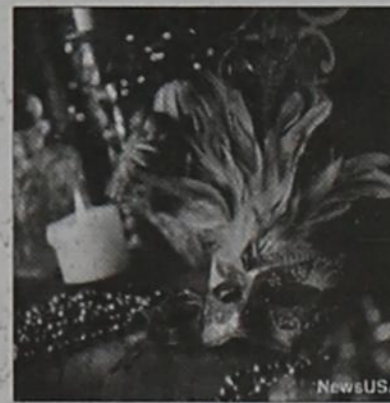
Inspiration for a party theme can come from anywhere - masquerades, Jersey Shore, clothing - but these tips will get you thinking.

soundtrack. The horror film from Seven Arts combined tunes from Zombie Girl and Creature Feature for a scary popular soundtrack available for download on iTunes.