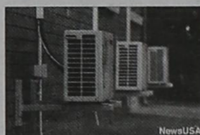
Energy-efficient HVAC systems can save you money with purchase rebates on top of monthly savings on utility bills.

The experts at Carrier suggest that those planning to install energy-efficient technologies talk to a local contractor about potential HVAC purchases and take a look at www.energy.gov/taxbreaks.htm