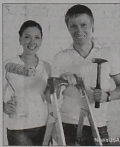
Having the right tool for the job is key for any DIYer.

and an all new, two-speed gear box and 18-position clutch.