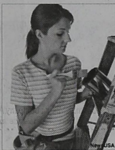
Remodeling is a great time to think about energy-saving solutions for your home.

Though investing in energy-efficient heating and cooling may have the biggest impact on reducing household energy use, homeowners should approach energy ef-