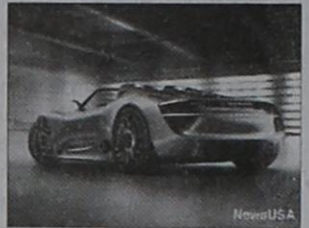
Hybrid cars can hold their own on the racetrack.

The GT3 R's innovative hybrid technology has been developed especially for racing. The front axle features two powerful electric motors that supplement the car's 480 horsepower, naturally aspirated four-liter flat-six that drives the rear wheels. Instead of the heavy batteries found in hybrid road cars, an electrical flywheel power generator resides