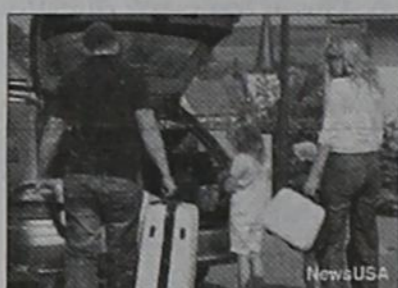
With proper planning and research, holiday travelers can take the comforts of home with them on the road.

(NU) - Whether you plan to be on the road or celebrating at home for the holidays, you'll likely get caught up in the excitement and the frenzy the season brings. Holiday travel poses a special set of stresses, like airport delays and traffic, which can leave you feeling tense and overwhelmed. That's why it's smart to always bring along some of the comforts of home to help keep you relaxed and prepared.