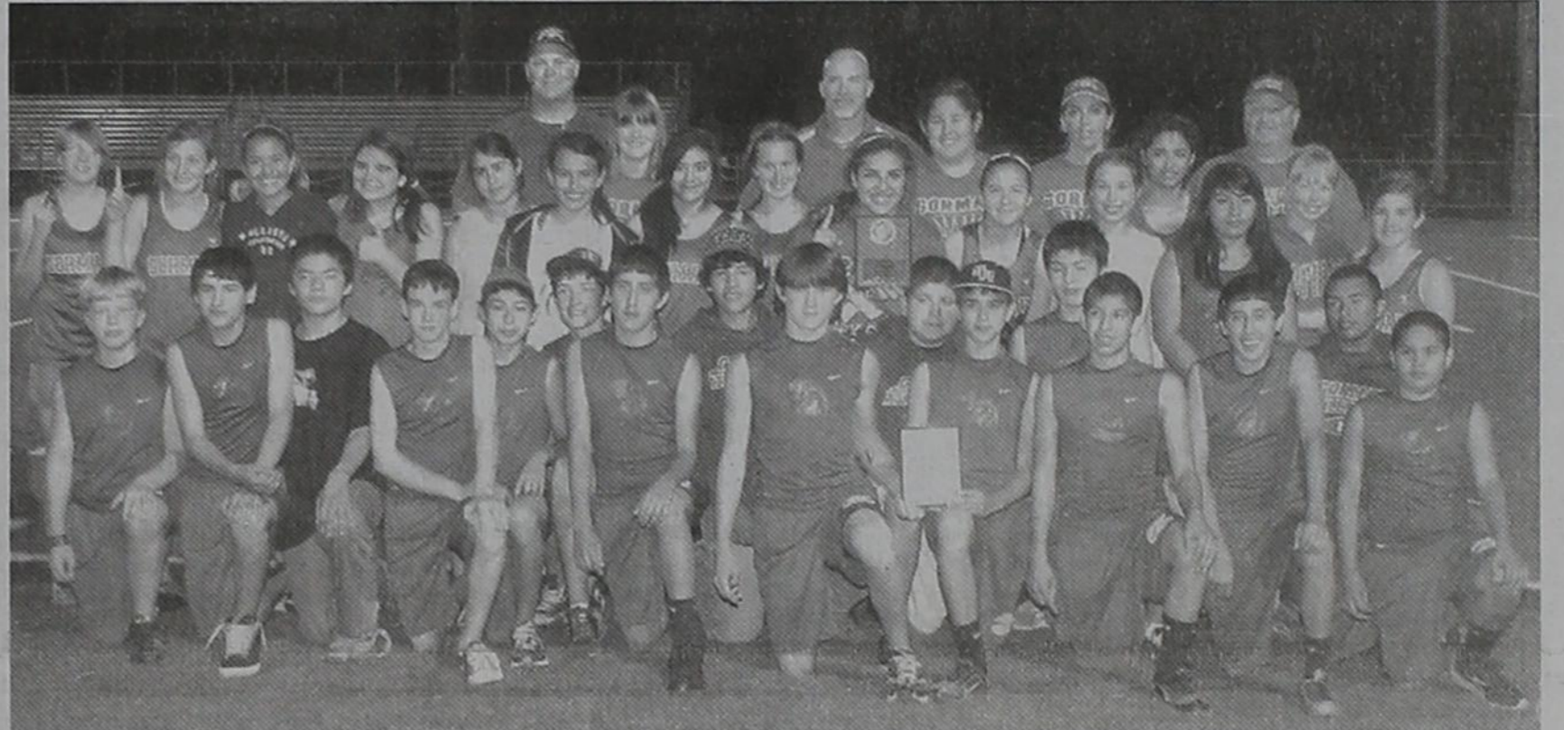
Gorman Middle School boys and girls team take FIRST PLACE at the district track meet on Monday, April 9, 2012. Both teams outscored their nearest opponent by a very wide margin. These athletes all did an exceptional job at the meet.

Gorman High School and Middle School both participated in their district track meets recently. Both teams did exceptionally well with high school sending many participants on to the Area Meet to be held on Thursday, April 12, and the middle school boys and girls taking the district championship title! These Gorman athletes all did great jobs on these two very exhausting days spent at the meets.