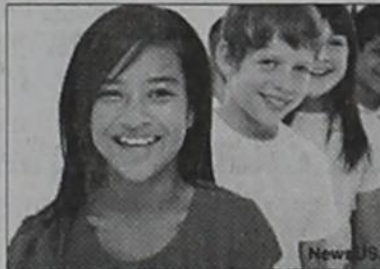
If you have a preteen or teen, make sure they receive proper vaccinations.

ria and pertussis. Pertussis, or whooping cough, can keep kids out of school and activities for weeks. It can also be spread to babies, which can be very dangerous and sometimes deadly.