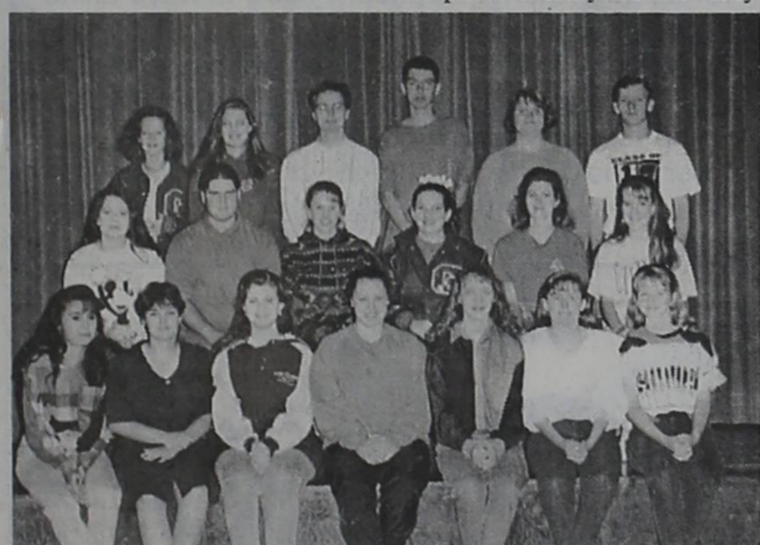
DISTRICT U.I.L. CONTESTANTS

contest on March 26th at Robert Lee High School. The students did well and placed in many contests. They