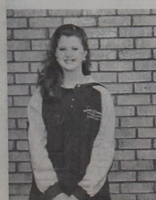
STATE U.I.L. CONTESTANT