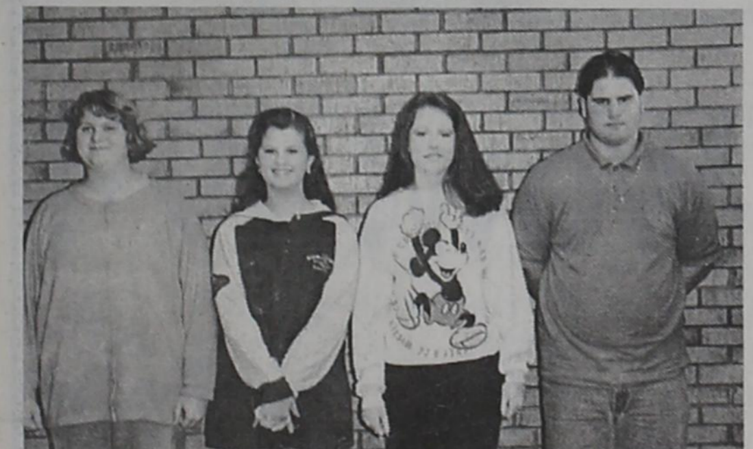
REGIONAL U.I.L. CONTESTANTS