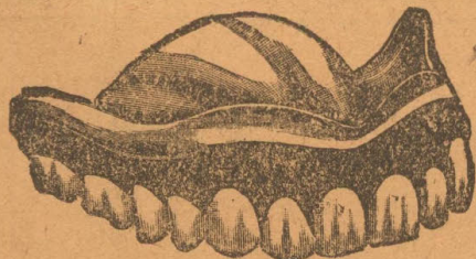
Plate Work—Have your impression taken in the morning and get your teeth the same day. Any mouth fitted.