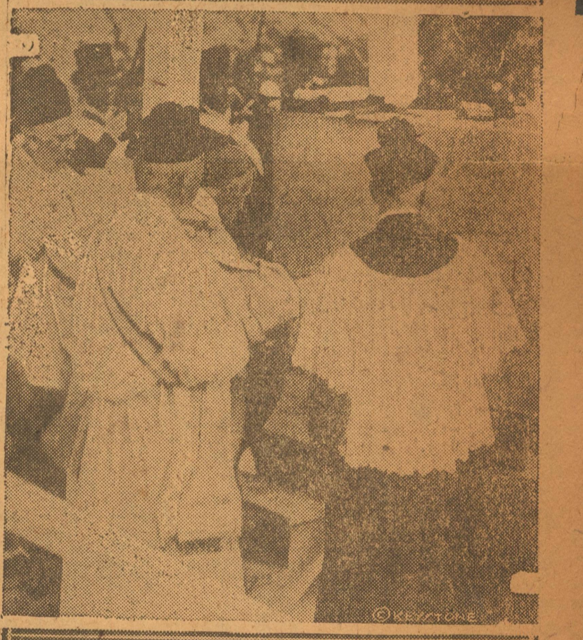
Cardinal Gibbons, stooping figure, laying the cornerstone.

The venerable Cardinal Gibbons laid the cornerstone of the new Shrine of the Immaculate Conception at the Catholic University at Washington recently. Catholic dignitaries from many sections of the country attended the dedication ceremony.