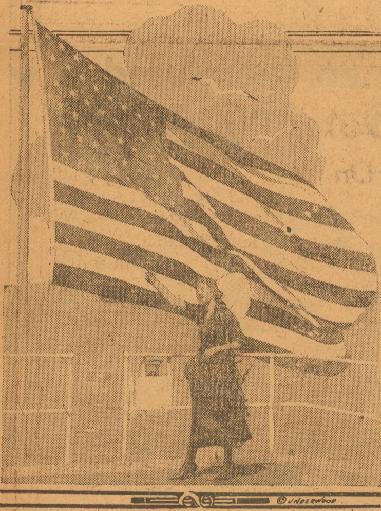
Proud passenger cheering as the "Panhandle State" leaves dock.

The "Panhandle State," said to be the first 100 per cent American passenger liner built in twenty years, recently began her first voyage to Queenstown, Bologne and London. She was built by the U. S. shipping board. Other "American made" liners are to follow. Heretofore all the liners have been foreign-owned.