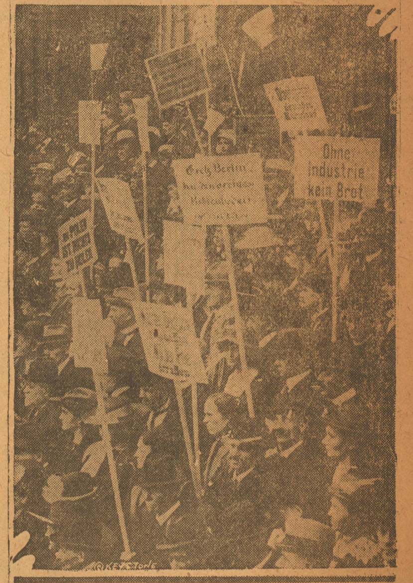
A big demonstration against the Poles for their alleged mistreatment of Germans in Upper Silesia, territory formerly German but now Polish, was recently staged in Berlin. The photo shows the demonstration in full blast. One of the banners reads: "What the Germans make, the Poles destroy."