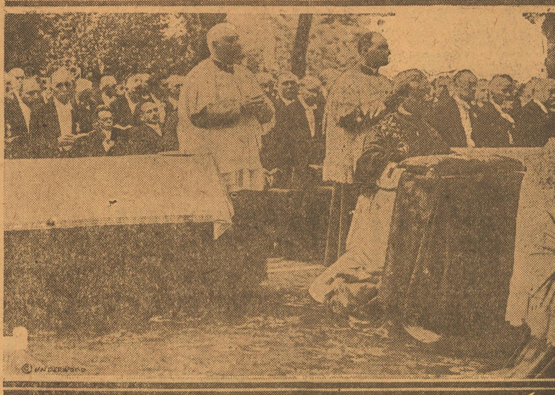
Pope Benedict, kneeling in foreground, during the services in vatican gardens. The group of members of the Knights of Columbus who have been abroad studying conditions as representatives of that body, were signally honored on their visit to the vatican when Pope Benedict, after receiving them, celebrated high mass in the vatican gardens in their honor. The photo above shows the pope and some of the knights during this service.