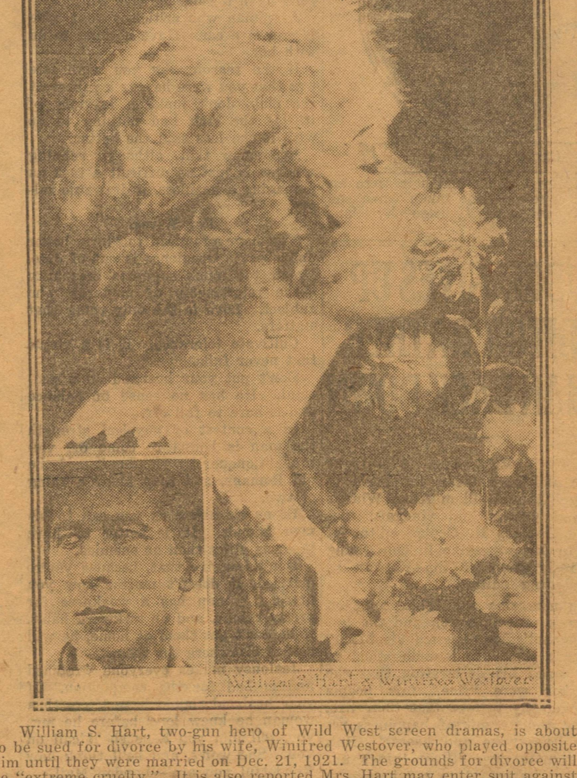
William S. Hart, two-gun hero of Wild West screen dramas, is about to be sued for divorce by his wife, Winifred Westover, who played opposite him until they were married on Dec. 21, 1921.