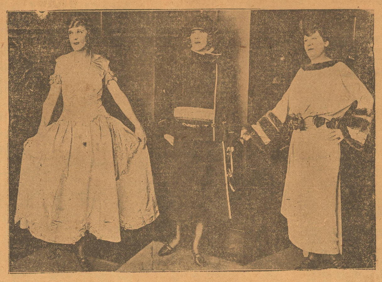
FOR THE DAINTY DEBUTANTE Agnes has designed this bouffant 'rock of changeable rose taffera. its bodice and part of its wide skirt sprinkled with silver spangles. The tiny sleeves are formed of a garland of delicate taffeta roses, and the skirt is almost to the floor.