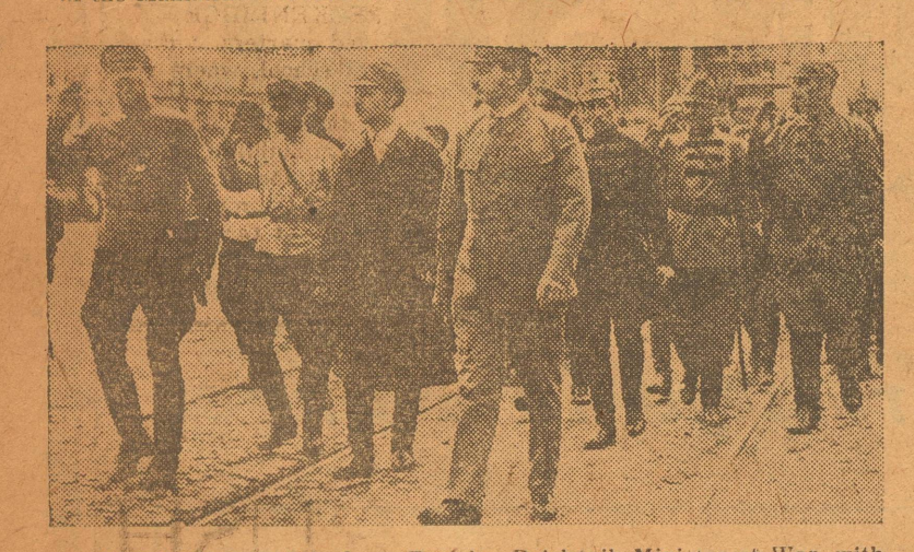
RED INSPECTION-Leon Trotsky, Bolshevik Minister of War, with members of his staff inspecting Red forces in Moscow during a revolutionary celebration.