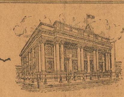
Main at Murphy Street

Companies, firms or individuals having need of a banking connection at Dallas, are invited to figure with us.