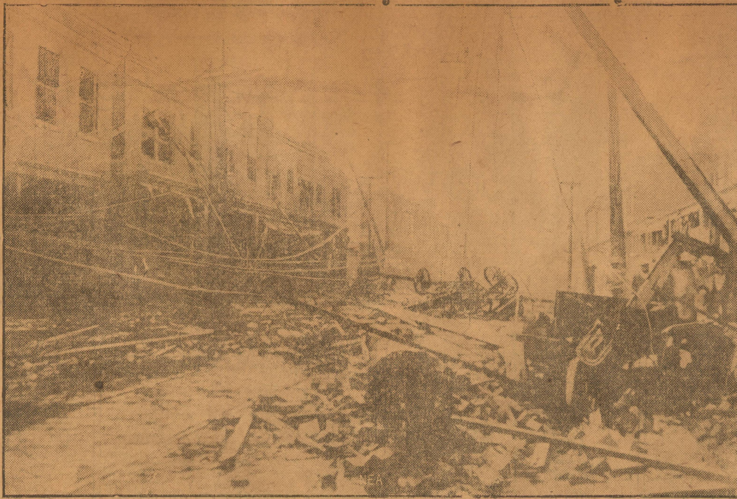
Debris was piled high in Sarah street, St. Louis, after the cyclone struck. National guardsmen were mobilizing immediately to clear away the wreckage; scenes like the above were common on many of the city's thoroughfares. A number of deaths and many injuries occurred in the neighborhood shown above.