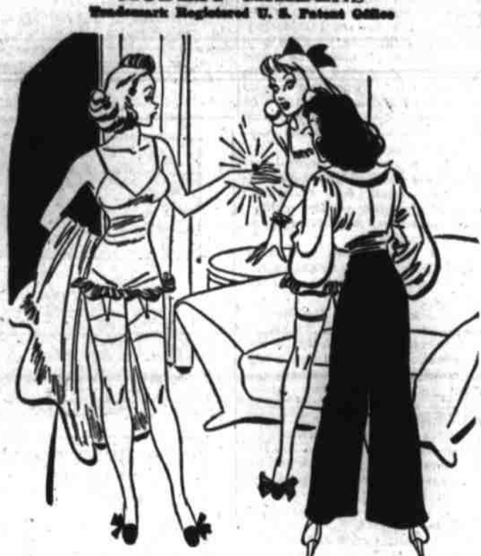
... but the box of candy that he found it in wasn't very good