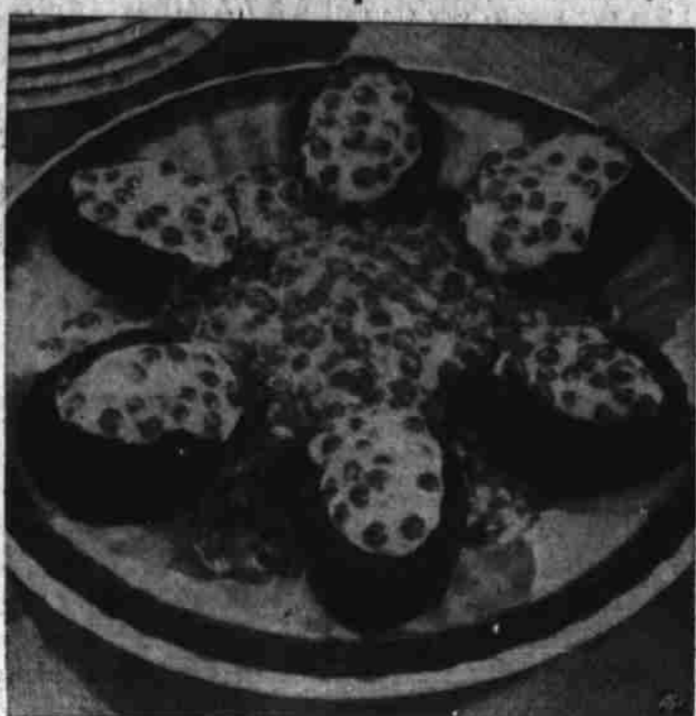
Simple enough for a bride—lamb boats with creamed vegetables.