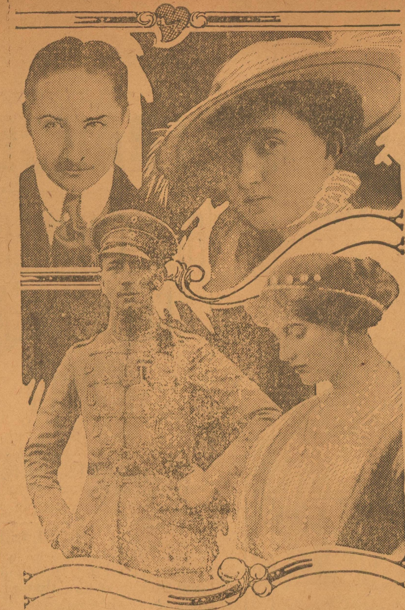
Above: Ex-Prince August Wilhelm and ex-Princess Joachim. Below: Ex-Princess Joachim and ex-Princess August Wilhelm.

Prince August and Prince Joachim, respectively the fourth and sixth sons of former Emperor Wilhelm of Germany, have brought suits for divorce, according to Berlin advices to the Paris Matin. Both marriages took place under circumstances apparently auspicious, and a son has been born in each case.