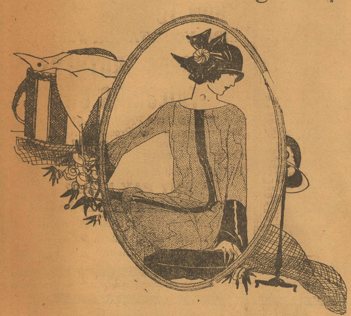
LOVELY DRESSES AND SUITS—CHARMING MILLINERY Bespeak for this Department A Glorious Season.