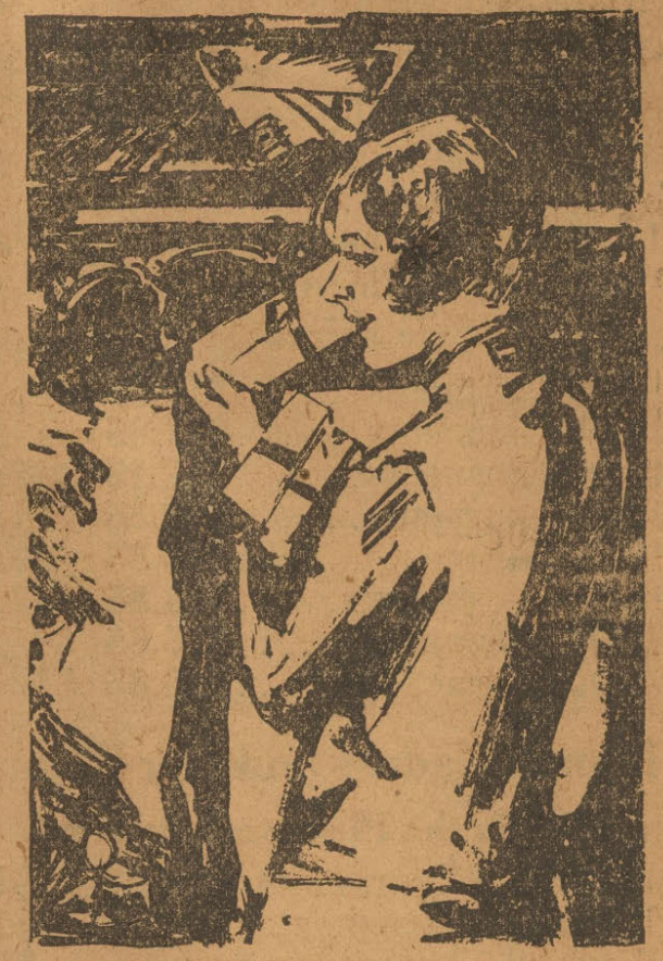
It is well to remember your few closest friends with a supply of Camels for Christmas Day and the days to come. Get your Camel cartons now and then they will be ready! R. J. Reynolds Tobacco Co.