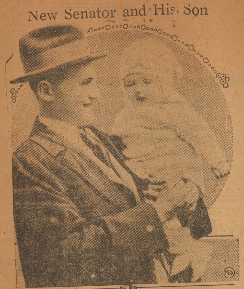
is is Gerald P. Nye of North Dakota, appointed by Gov. natorial post vacated by the death of the late Senator Ladd. A contest