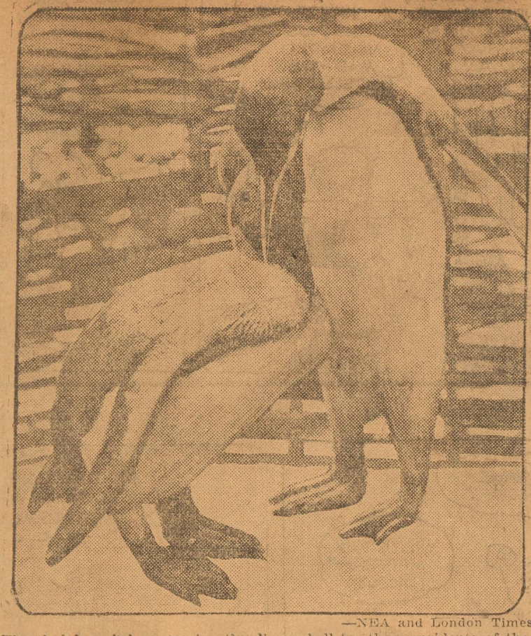
The chef doesn't have to ring the dinner bell for these residents of the London zoological gardens. A young penguin is shown taking the nour-ishment that mother so kindly provides.