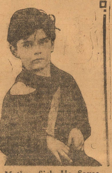
Mother Sick He Saves Family

ALTHOUGH Frankie Darro only started his career eight years ago, in the back room of a theater in Chicago, he is already the supporter of his invalid mother. He started his acting when only three, and at the age of five was in Los Angeles, when his mother was taken sick. Spurred by a desire to help, the little urchin, wise beyond his years, went to the Ince Studios, where he appealed for work. A famous director immediately gave him a part, and since then there have been no worries. Much younger than Jackie Coogan, whom he succeeds, he is headed for heights that other kid stars have never scaled. As "the little cripple kid, in 'Moulders of Men,' the FBO-Elk picture, he proves beyond doubt, his right to the Coogan's crown.