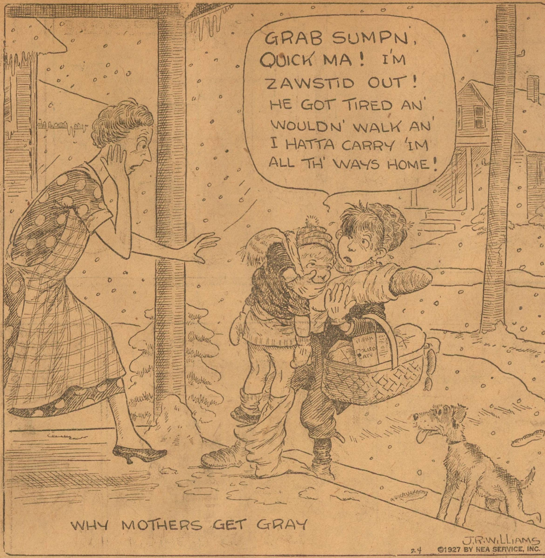
WHY MOTHERS GET GRAY

J. R. WILLIAMS © 1927 BY NEA SERVICE, INC.