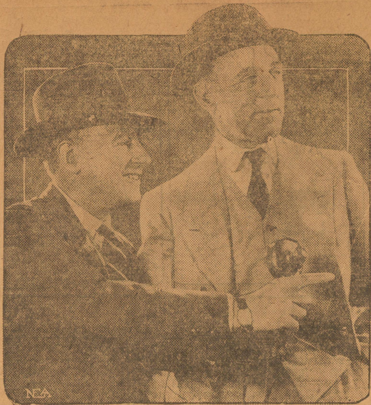
Cecil B. DeMille (left) and D. W. Griffith long have been top-notchers of moviedom, but this was the first time they ever were photographed together. Griffith visited DeMille in California and assisted him on a forthcoming picture.