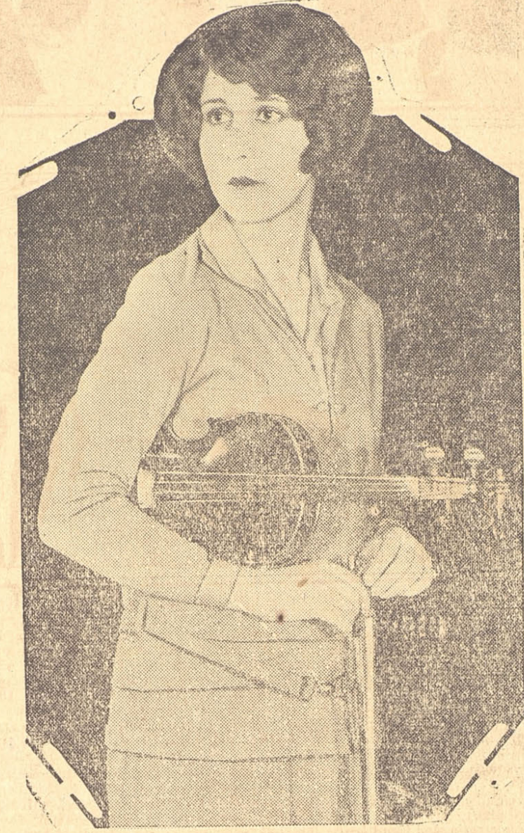
A girl stood staring at him, her violin cradled in her arm.

Help Support Your Schools TAX COLLECTOR 01 South Austin Ranger, Texas