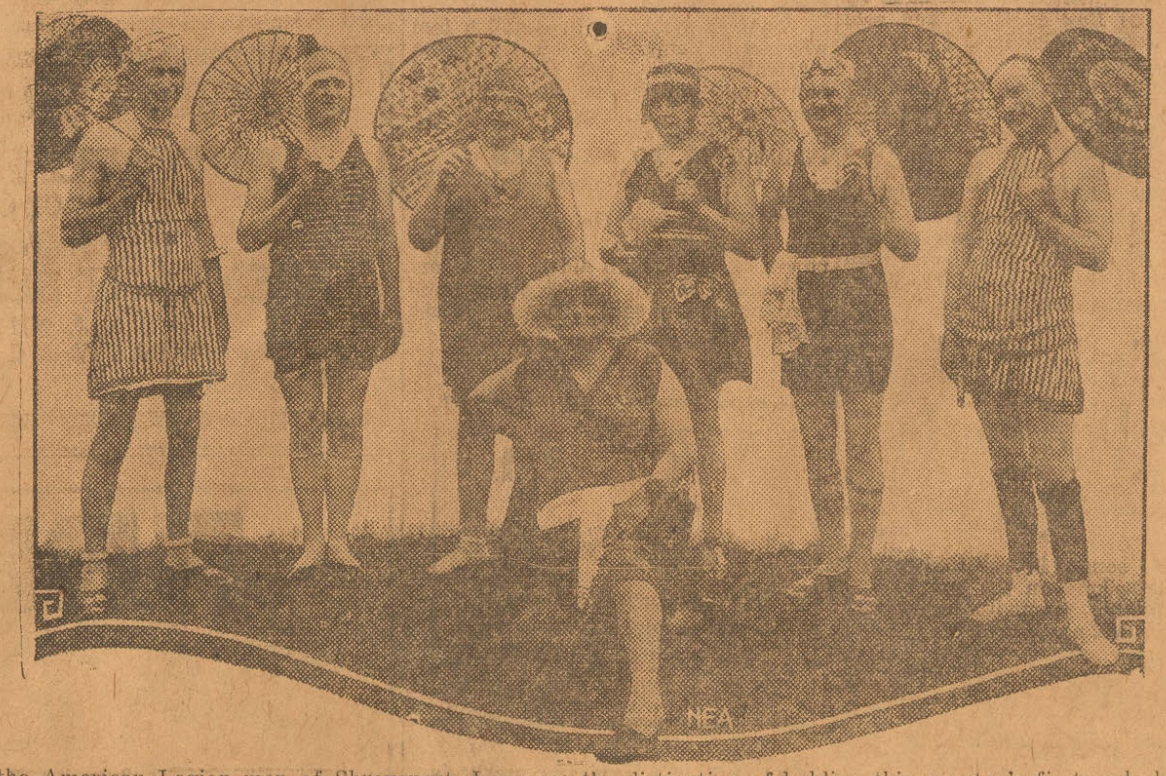
Drilling around the Parsons pool is To the American Legion men of Shreveport, La., goes the distinction of holding this country's first male beauty fast and furious. There are nearly 30 locations and a number of producing wells and those who can't get in on the close-up stuff pre leasing and starting around the part of producing the contest.