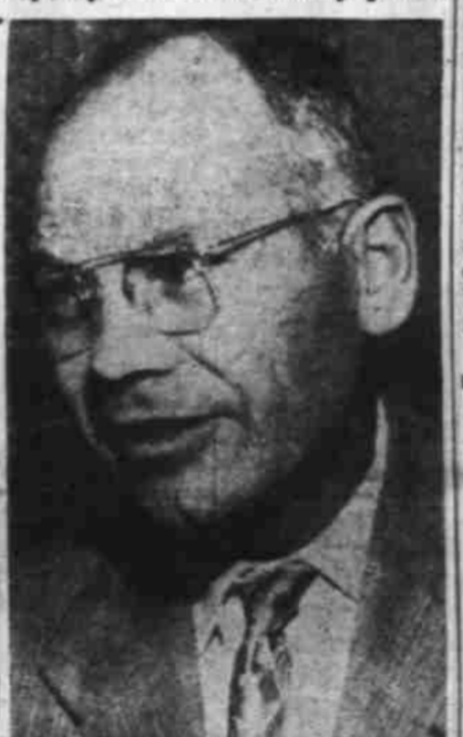
Portrait of a man, likely related to the vampire deaths story

LONDON, March 4. (AP)—Scotland Yard detectives picked up new clues today as they sought a solution to the "vampire" slayings of possibly six—maybe more—persons whose bodies were dissolved in acid.