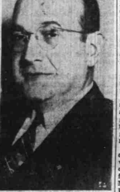
LOUIS A. JOHNSON

Johnson, 58-year-old West Virginian, has served in the past as assistant secretary of war. His career includes a term as national commander of the American Legion, years of practicing law, and experience as a money raiser in Mr. Truman's election campaign last year.