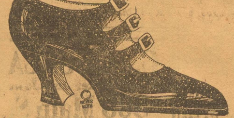
Three Strap Patent —As illustrated to the left with high heel and turn sole and buckles take the place of buttons, or if you prefer it can be had in black kid or brown suede with patent straps. All three are Red Cross and sell regular for $9.50, but now...$6.95

Shoe bargains were never so great as they will be during this Easter Shoe Sale. Friday is the beginning of this big sale and we are going to make it the biggest Shoe sale we have ever had. Stocks were never more complete nor styles more varied as they are at Joseph's this season. We have prepared for an enormous shoe business and if it takes prices to get it we are going to have it. Don't let this sale pass without buying your shoes. You will realize the magnitude of this sale when we tell you you can buy any woman's shoe in stock for but $6.95 and plenty of them cheaper than that. Read prices, then come to this mighty Shoe Sale.