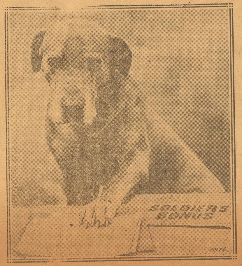
the "get"in budget.—Col- grand-ma brag on his new pair of bonus. Signing a petition is easy for an actor accustomed to big checks.