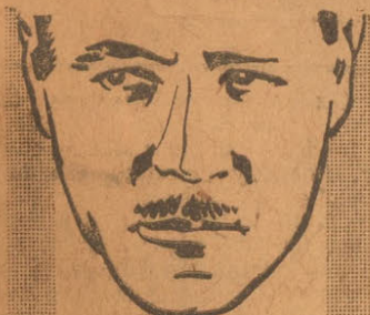
PRESENTED BY ADOLPH ZUKOR