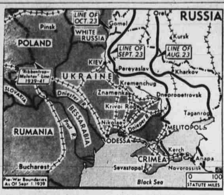
Gateway To Crimea—Capture of Melitopol, gateway to the Crimea, was announced by Marshal Joseph Stalin. Coupled with the drive toward Krivoi Rog from the north, it threatens the entrapment of Germans defending the Crimea.

ALLIED HEADQUARTERS IN THE SOUTH-WEST PACIFIC, Oct. 25 (AP)—Japanese forces which for a week struggled to break through Australian lines to reach the New Guinea coast near Finschhafen have been whittled down and thrust back into the jungle-matted hills.