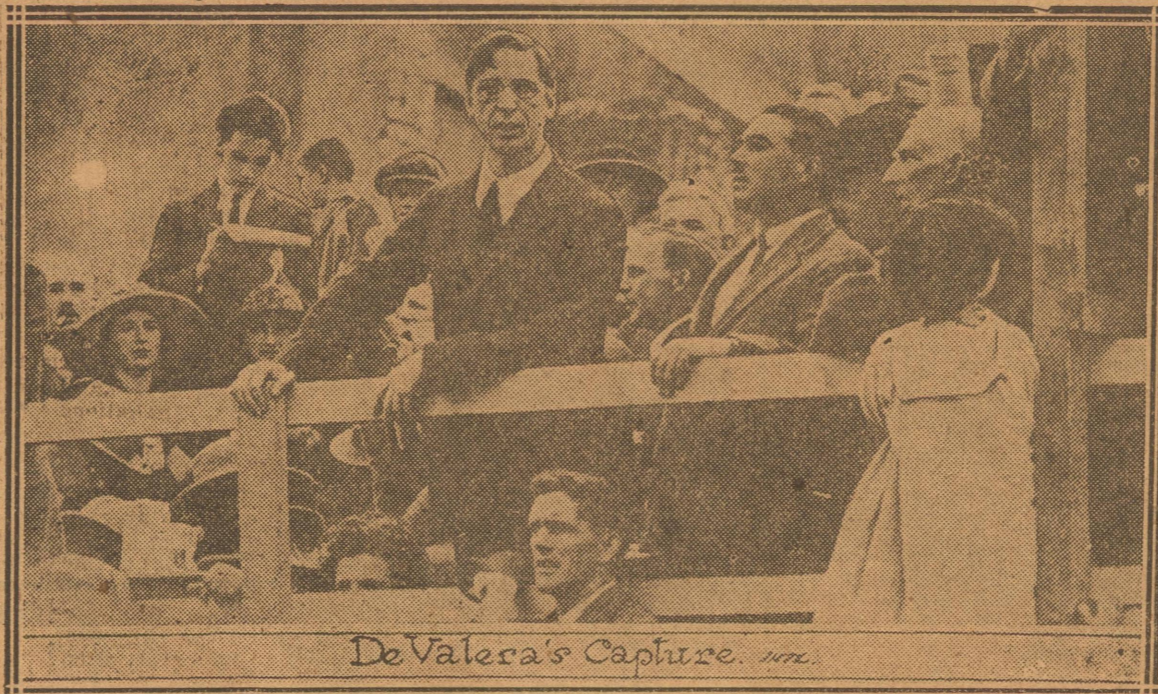
This photograph was snapped at the instant Irish Free State soldiers, firing a volley into the air, rushed the speakers' stand at Emis. County Clare, to arrest Eamonn de Valera, "president" of the Irish republic, who had eluded arrest for several years. De Valera fainted as the soldiers rushed for him. He was arrested and taken to an unnamed jail.

CHAIRS AND BENCHES NEEDED FOR REVIVAL The Ranger post of the Salvation Army will have a revival and it finds that there will be a need for chairs or benches. Those who can lend chairs are asked to get into communication with the commanding officer at his residence next to the army hall on South Austin street.