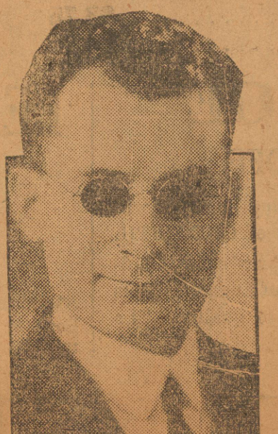
but he was graduated from the Unirsity of Texas, with high honors, course in three years, inventing and selling candy and cigar slot machines to pay his way through, #