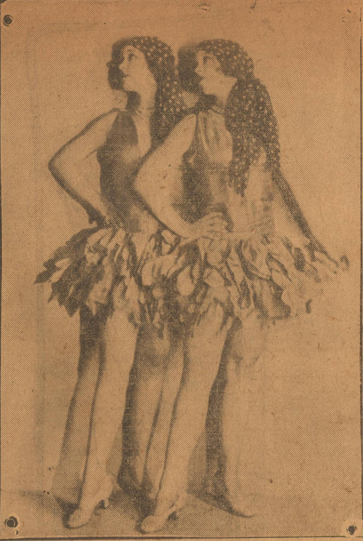
Gregory Sisters, brilliant sister team, with the "Greenwich Village Follies," coming to the Liberty Theater, Ranger, Monday, March 15.

The "Greenwich Village Follies," a big gorgeous harlequinade, brilliant, dazzling and gay, is announced as the attraction at the Liberty Theater, Ranger, on Monday, March 15. The special edition of the "Follies" with its wealth of beautiful girlhood, frolics through two acts and thirty colorful scenes which are punctuated with smart dancing numbers, beautiful songs, gay pictures and new and glittering surprises in dancing specialties and they all move with uncommon fleetness. It is in the numerous spectacular features that the "Greenwich Village Follies" excel.