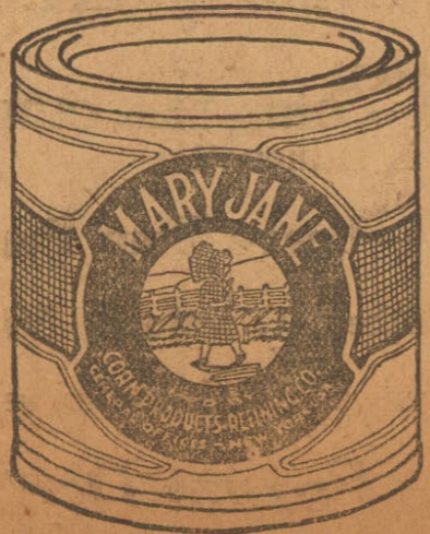
Many Jane Cans are honest weight—contain full weight as label indicates.

MARY JANE SYRUP is a rich, nutritious food—a great health builder. It adds strength to flavor and makes everything it is used for more delicious. Your Grocer always has it.