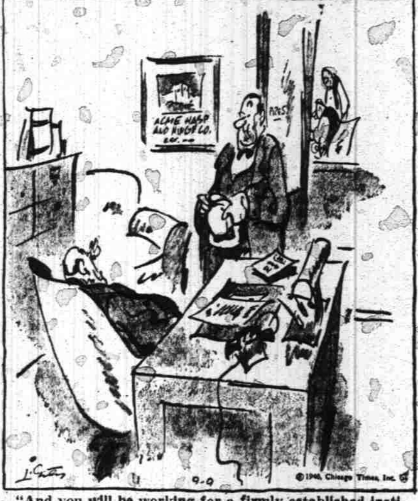
"And you will be working for a firmly established institution—it has weathered one depression, two fires, and a joint checking account with my wife!"