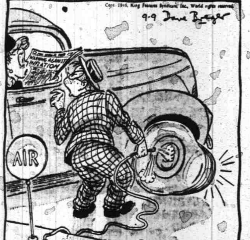
"I tell you, unless we wake up to reality we're headed for a big boom and bust!"