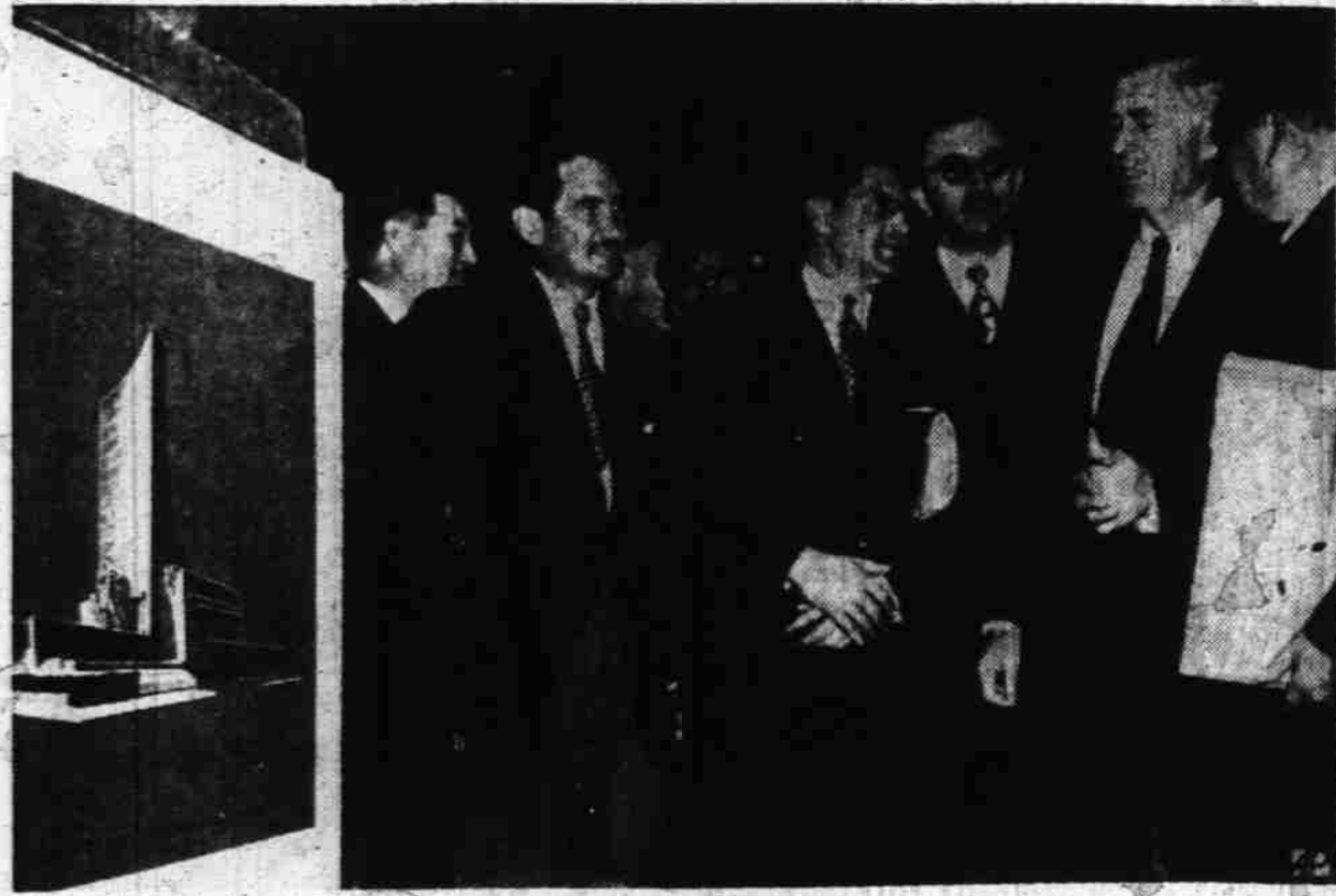
WALLACE VIEWS WINNING SKETCH—Henry A. Wallace, US Secretary of Commerce (second from right) looks over, in Mexico City, a sketch of the winning entry in a contest to select a memorial to Franklin D. Roosevelt to be erected at Monterey where the late US president and President Avila Camacho of Mexico met in 1943 to cement US-Mexican friendship.