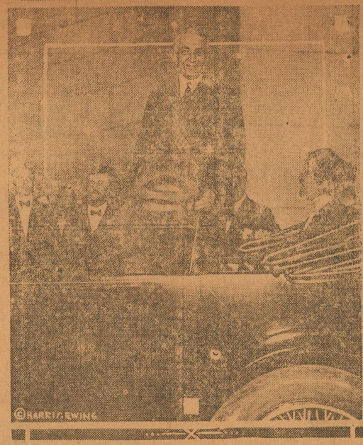
Senator and Mrs. Harding photographed in Washington on return from Chicago convention.