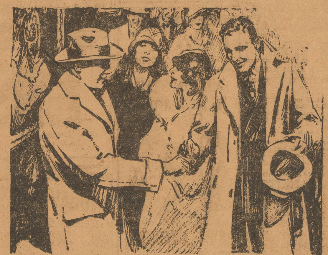
No other cigarette in the world is like Camels. Camels contain the choicest Turkish and domestic tobaccos. The Camel blend is the triumph of expert blenders. Even the Camel cigarette paper is the finest-made especially in France. Into this one brand of cigarettes is concentrated the experience and skill of the largest tobacco organization in the world.

WHEN the exciting scenes are over. And you leave the great theatre thrilled at what you've seen. When, as the organ peals forth its rolling music, you come outside with jovial, laughing friends-have a Camel!