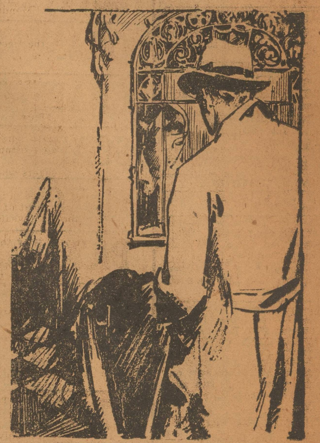
Our highest wish, if you do not yet know Camel quality, is that you try them. We invite you to compare Camels with any cigarette made at any price. R. J. Reynolds Tobacco Co.