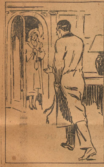
She paused at the threshold,

"Bah! Who ever told you you could make a cocktail? What are