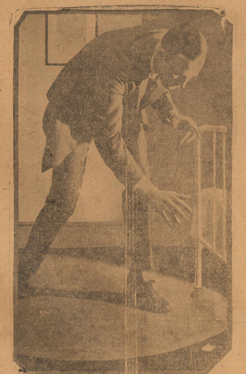
On the floor it looked like a plain yellow square of cardboard.

Leveille-Maher MOTOR CO. Phone 217—Ranger