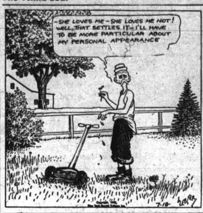
SHE LOVES ME - SHE LOVES ME NOT! WELL, THAT SETTLES IT - I'LL HAVE TO BE MORE PARTICULAR ABOUT MY PERSONAL APPEARANCE

School Bells Ring For T&P Officials Key officials and department heads of the Texas & Pacific Railway company started back to "school" today.