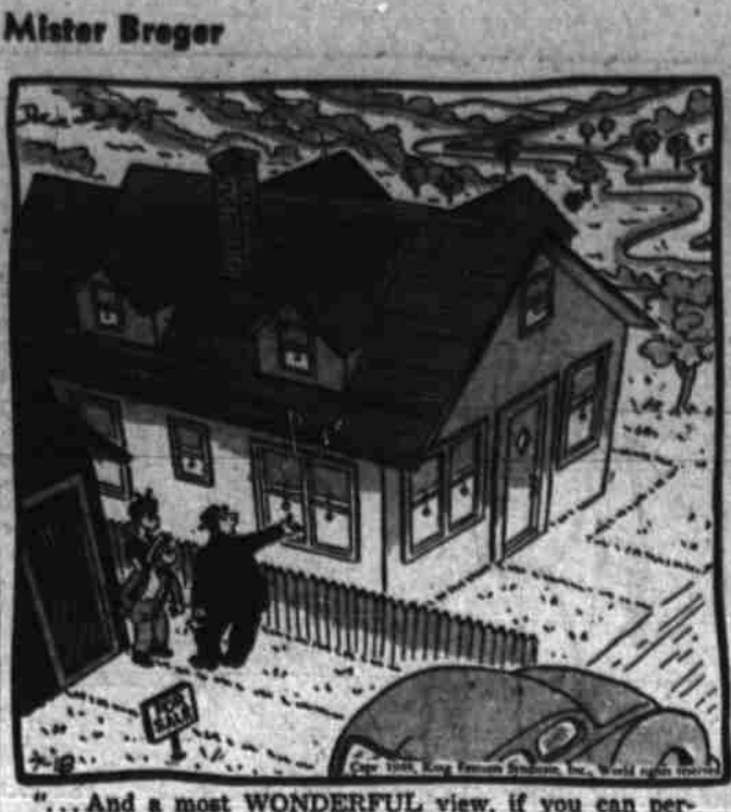
And a most WONDERFUL view, if you can persuade your neighbors to leave their shades up...