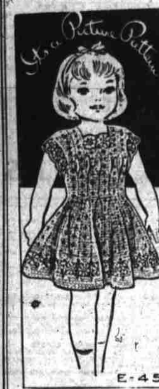
Design No. E-459

A lady party frock for the wee miss 2, 4 and 6 is crocheted with daisy chain trimming. Inexpensive and easy to create. Pattern No. E-459 contains complete instructions. Patterns are 20 cents Each. An extra 15 cent will bring you the Needlework Book which shows a wide variety of other designs for knitting, crocheting, and embroidery; also quilts, dolls, etc. Free patterns are included in book. Send orders, with proper remittance in coin, to Needlework Bureau, Big Spring Herald, Box 229, Madison Square Station, New York N.Y.