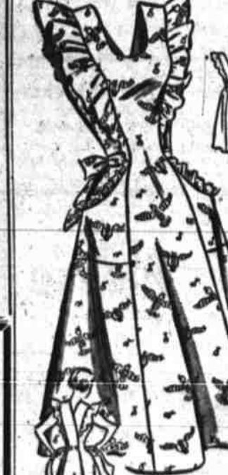
2911 SIZES 12-46

A pinafore like this is pretty enough to wear for a sun dress as well as kitchen capers. And there's nothing like looking your best when you come out of the kitchen. No. 2911 is cut in sizes 12, 14, 16, 18, 20, 22, 24, 26, 28, 30, 32, 34, 36, 38, 40, 42, 44 and 46. Size 18 requires 5 1/2 yds. 35-in. Send 25c. for PATTERN with Name, Address, and Style Number. State Size desired. Address: PATTERN DEPARTMENT, BIG SPRING HERALD, 121 W. 19th St., New York 11, N.Y. Summer is the time for pretty styles—the Fashion Book the place to find them. Everything you need for that wonderful two weeks with pay, plus plenty of charming and wearable fashions for town, country, home. THE SUMMER FASHION BOOK brings you over 150 pattern designs for all ages and occasions, and all designed for easy sewing. Price just 25 cents. Order your copy now.