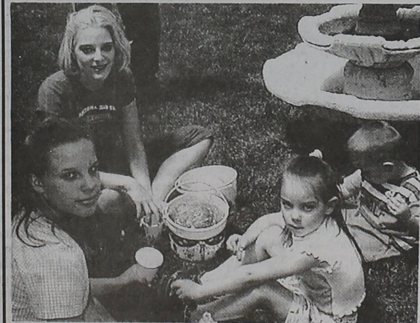
"Good day for an egg picnic."