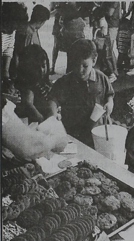
The crowd lines up to get some goodies at the annual Easter Egg Hunt on Saturday at the Farwell Convalescent Center.