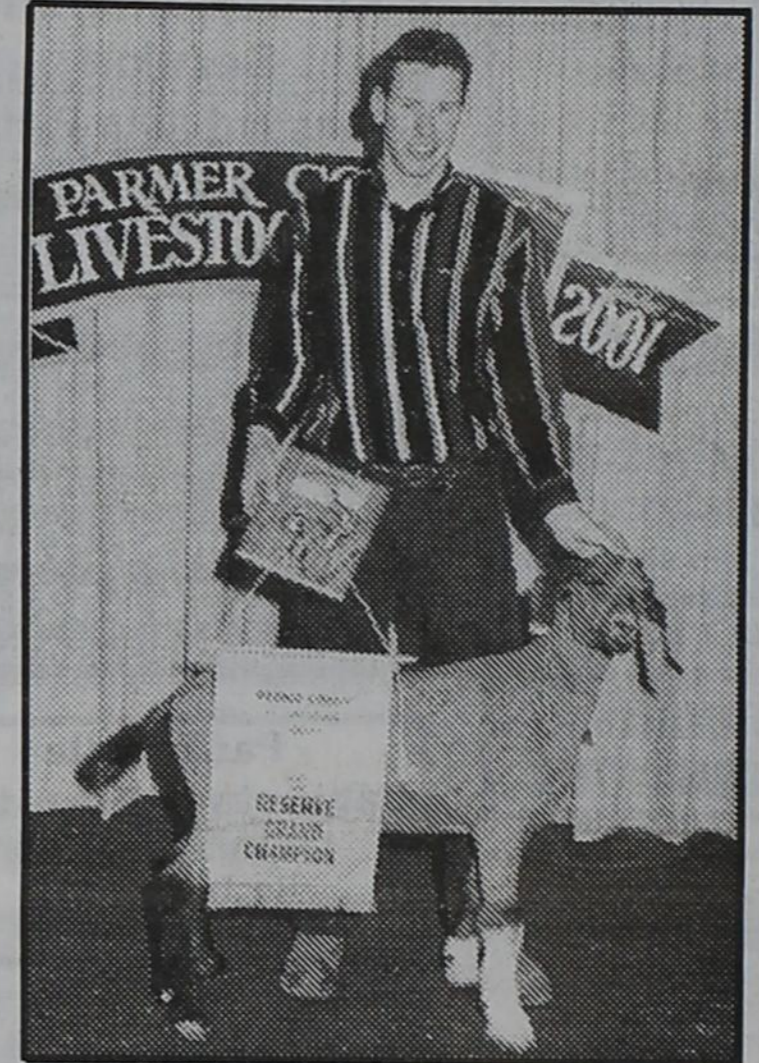
Waylon Bowery Reserve Champion Goats