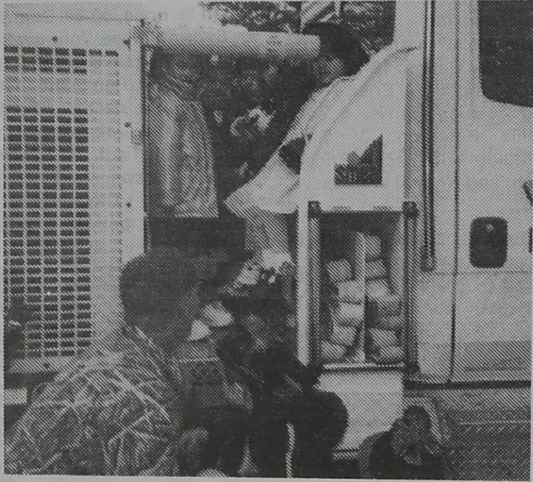
Head Start class students enjoy hopping aboard a fire truck.

-- Allowed the sheriff's department to buy two Ford Expedition 4x4s through a government contract.