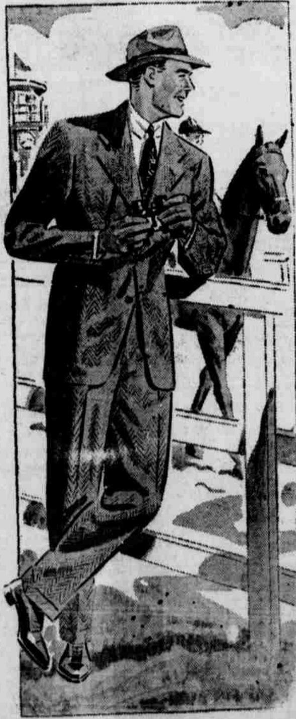
Above . . . A sturdy herringbone tweed for long wearing quality. Single breasted for ease and comfort. Blue, tan, grey and brown.