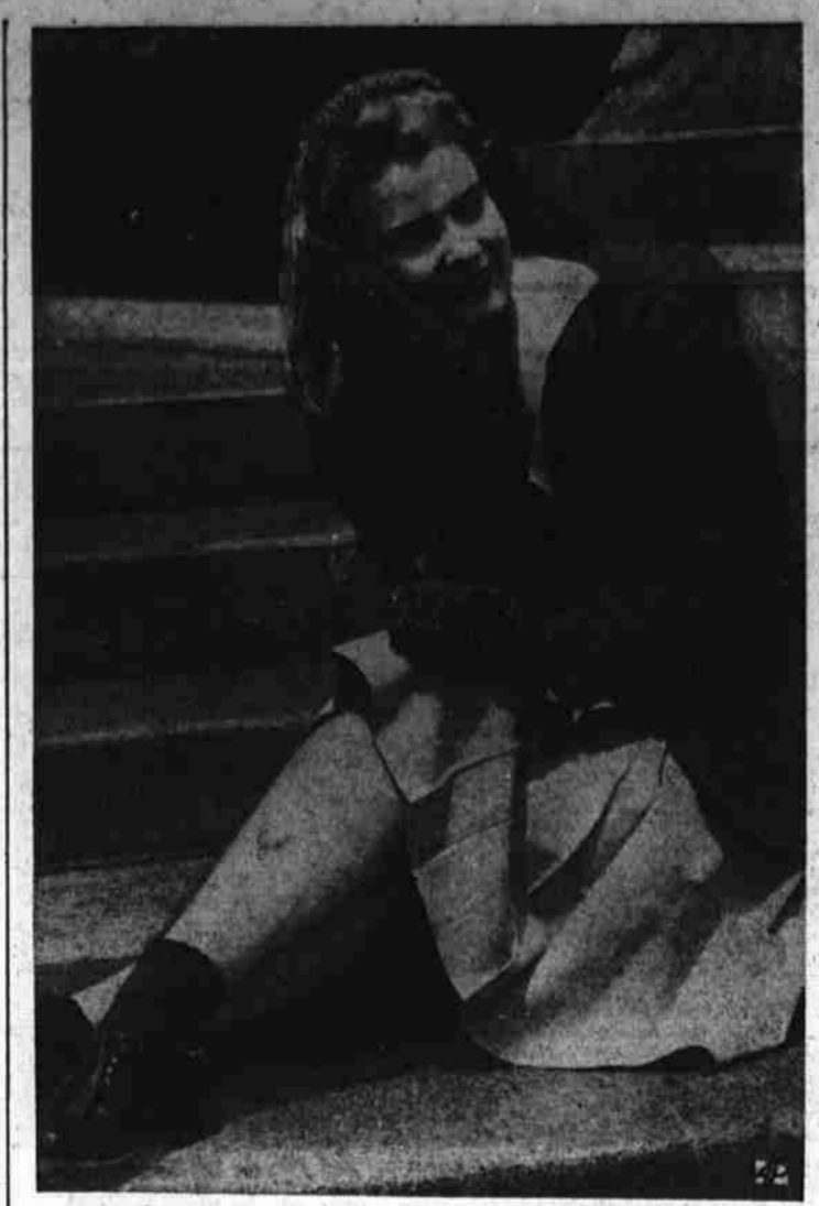
AMUSED MUSING—One, two, three is the count for this canny miss who already is getting her wardrobe ready for campus conquests. And one individualized combination for that wardrobe comes in this pleasant trio: a crimson pompadour hair band, heavily-fringed mittens, and shoe laces, all matching. They're all crocheted of cotton thread.

SINGIN' SAM, "The Coca-Cola Man," is literally one figure in show business who not only wanted to settle down on a comfortable farm but really did.