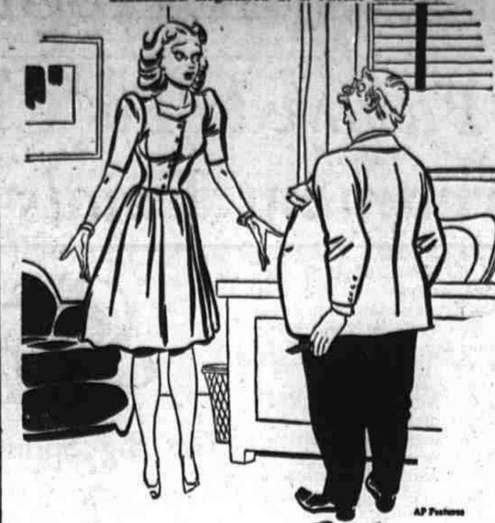
"But, Mr. Higgins, I've GOT to have a raise to pay for that vacation I just took!"