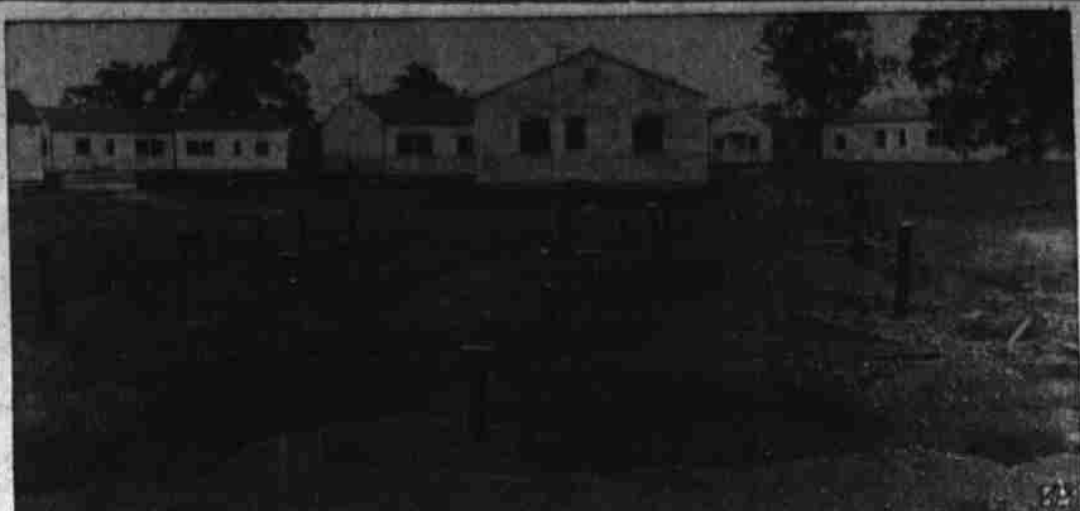
HOMES SPEED-UP —Prefabricated houses, part of a 650-structure project at Indianhead, Md., will soon cover these hills. The houses can be quickly assembled and dismantled.

See Us At— Cecil Bell's CHUCK WAGON 808 Gregg