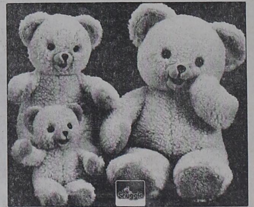
Not just for the dryer

The star of Snuggle Fabric Softener commercials is now available through Russ Berrie. This lovable bear sits smiling with his arms at his side, just waiting to be hugged. His cream-colored, lamb-soft, textured fur gives him super huggability. Available in three sizes: 10, 15, and 23 inches. Snuggle bear retails for $10, $20 and $40.