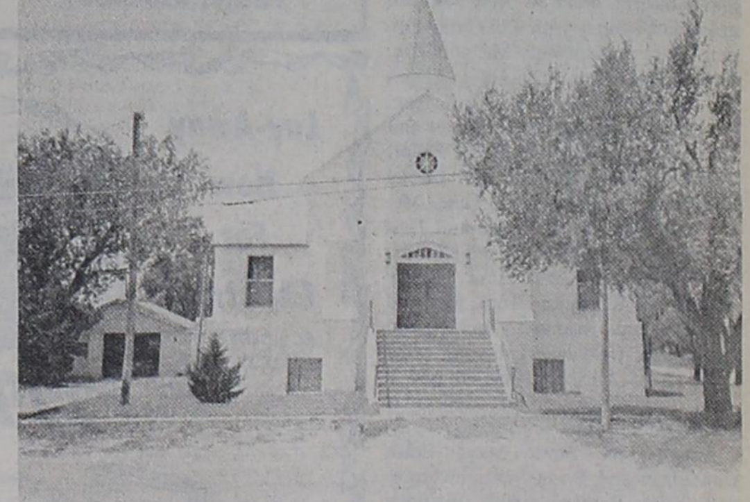
MOBEETIE UNITED METHODIST CHURCH

Tickets for the Turkey Holiday Dinner will be sold at the door and serving time is from 5:30 to 6:30 in Fellowship Hall. Tickets for the dinner are $5.00 for adults and $2.50 children under 12 yrs. of age. Make your plans to stay for the Grand Auction immediately after dinner. Numerous items of special demand will be for auction. A day of funfest is planned. Please accept our invitation to the public to come join us.