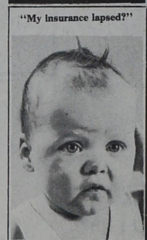
"My Insurance lapsed?"

A bulb-making capacity and the six petals to all its blooms mark all the members of the lily family. Thus, the calla, with its single bowl, is not a member of the lily family at all.