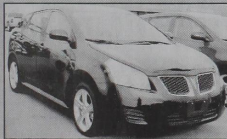
2009 Pontiac Vibe GREAT FUEL MILEAGE CITY MPG 21 HWY MPG 28

WARE CHEVROLET BUICK • PONTIAC South Hwy. 83 • Wheeler