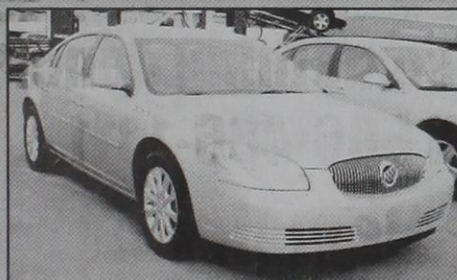
2009 Buick Lucerne CXL Leather, On-Star, XM Radio, Blue Tooth