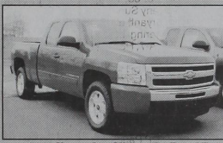
2009 Chevrolet Silverado Z71 LT 4x4, Extended Cab