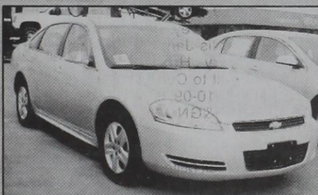
2009 Chevrolet Impala On-Star w/Turn by Turn Navigation, XM