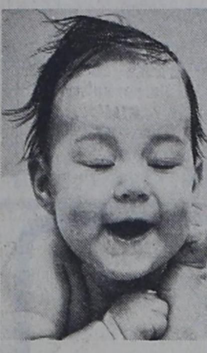
"Of course I had insurance!"

Your mobile home rolled over in a windstorm? A Mobile home Policy from Rives Insurance Agency would cover this loss.