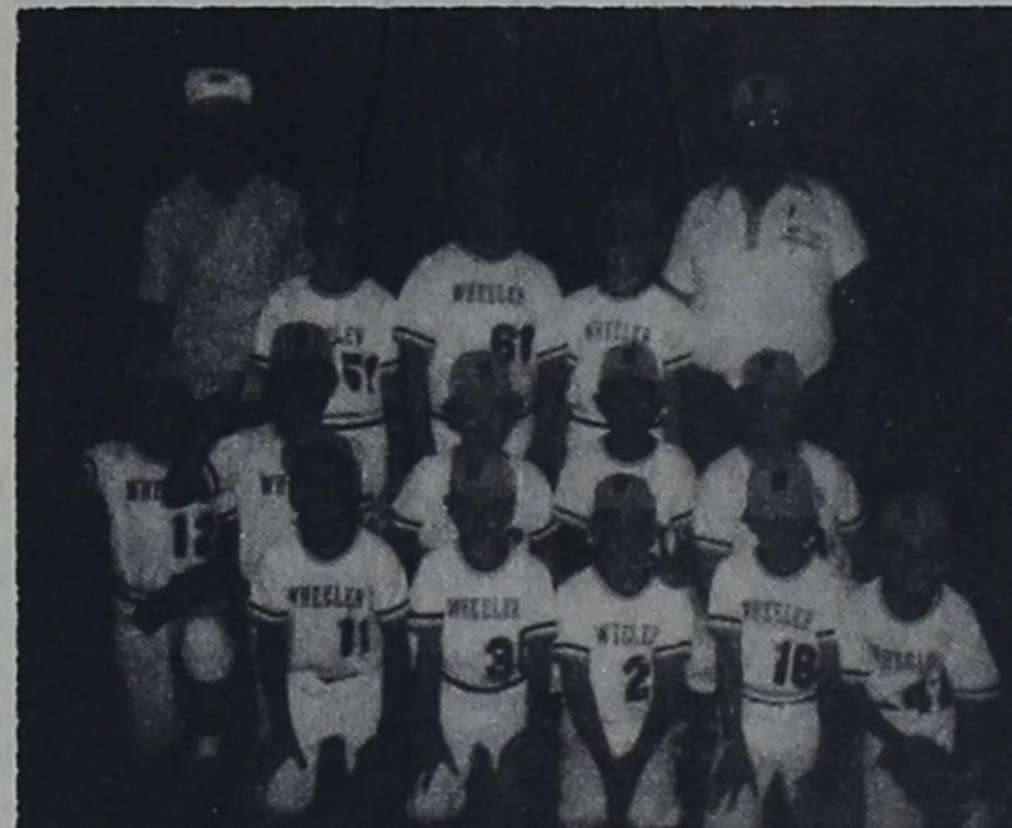
CHAMPIONS: the Eastern Panhandle Little League Championship was won this year by a Wheeler Team. Team members pictured above are (front row, l to

Rig No. 11 is located 4 miles west of Wheeler.