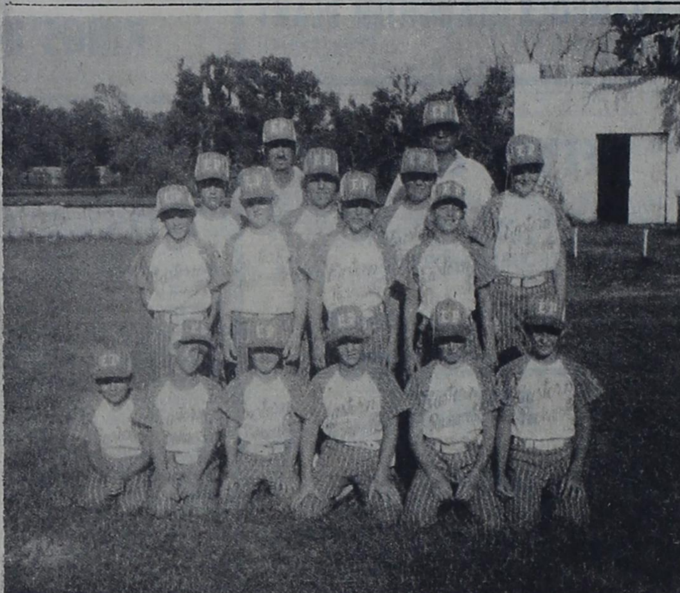
EASTERN PANHANDLE ALL-STAR: Team members from each of the five towns in the Eastern Panhandle division are selected for the Eastern Panhandle division are selected for the Eastern Panhandle All-Stars team at the end of the little league season. This team then enters the All-Star tournament. The Eastern Panhandle All-Stars entered the Childress Tournament in progress this week at Childress and were successful in

Plan now to be in attendance at the Rodeo Thursday, Friday and Saturday.