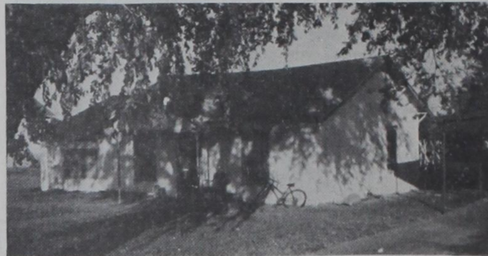
For Rent next week, 2 BR, 2 bath, $175.00 mo.

Ready to go fishing? How about a lakehouse on a Wheeler County lake? Sleeps 10+.