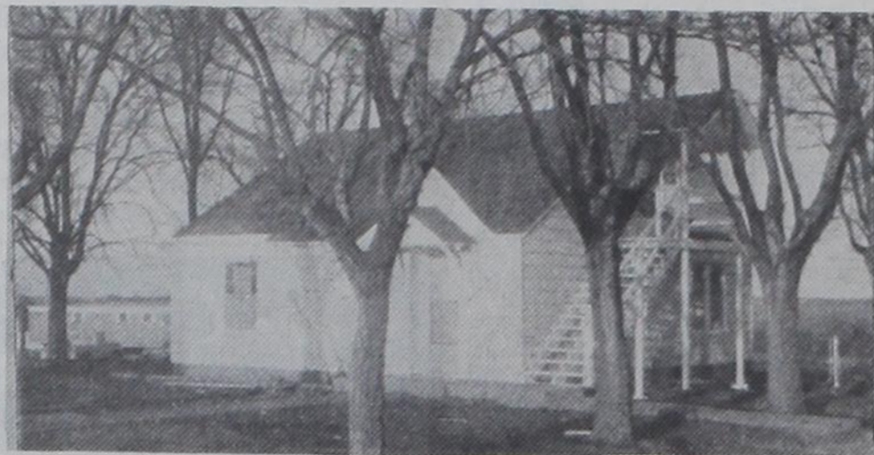
REDUCED #1 3 BR, 2 bath, detached garage, large fenced yard, Low move-in cost.