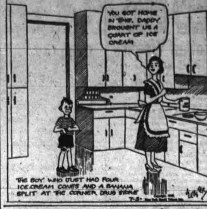
THE BOY WHO JUST HAD FOUR ICE-CREAM CONES AND A BANANA SPLIT AT THE CORNER DRUG STORE

OUR WATER (Continued From Page 1) would be for the purpose of insuring sound operation. Bonds not wholly payable from ad valorem taxes could be secured by a deed of trust lien on physical properties of the district.