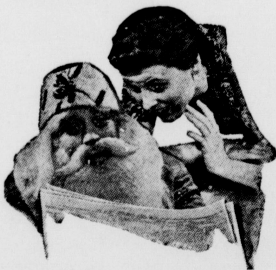
By the way, did you know only 59 shopping days remain until Christmas?